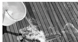
GENTLY WASH DECK WITH WOOD WASH