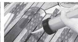
REPLACE CAULKING IN AREAS WHERE NEEDED WITH TEAK JAMMER